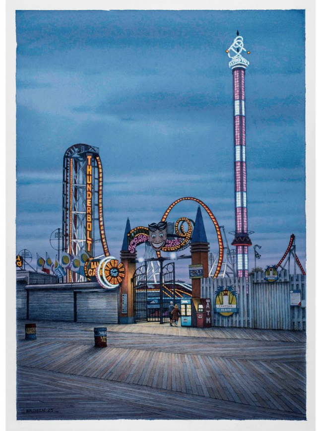
Frederick Brosen, Thunderbolt , 2025, watercolor over graphite on paper, 35 x 25 inches