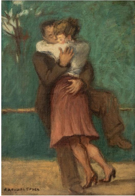
Raphael Soyer, Lovers in the Park , c. 1948, oil on canvas, 10 x 7 inches