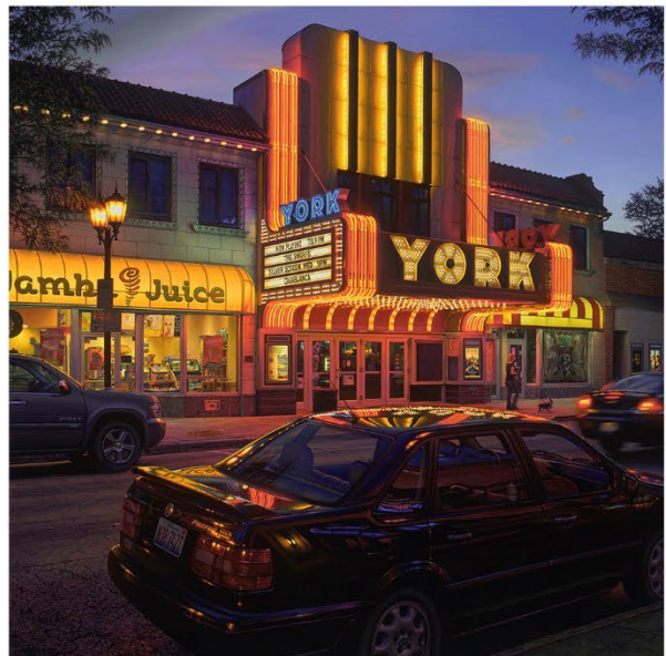
Davis Cone, York / Walking the Dogs , 2019, acrylic on panel, 24 x 24 inches