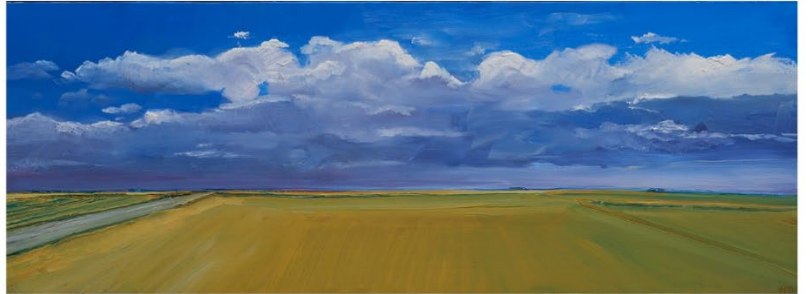
Wheat Field , 2023, oil on panel, 8 1/2 x 22 3/4 inches