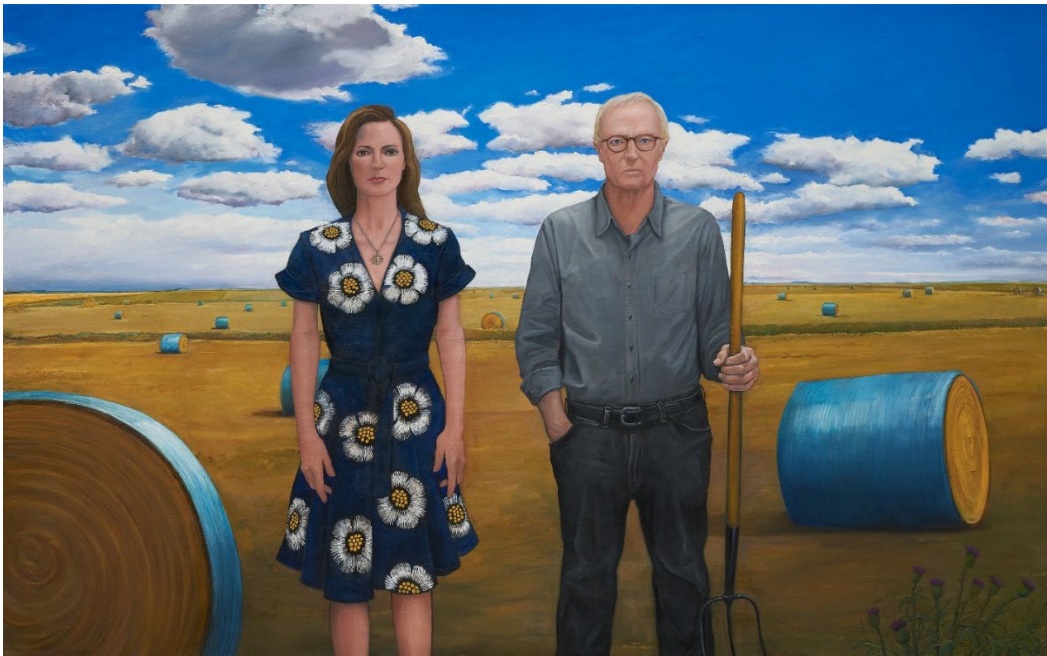
Straw Bales (Overcoat Series) , 2024, oil on canvas, 86 x 138 inches