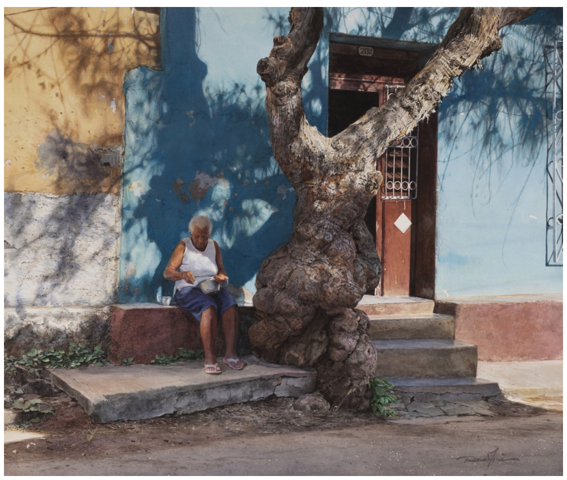
"Meditation" (2019; watercolor, 21 x 25 in.)