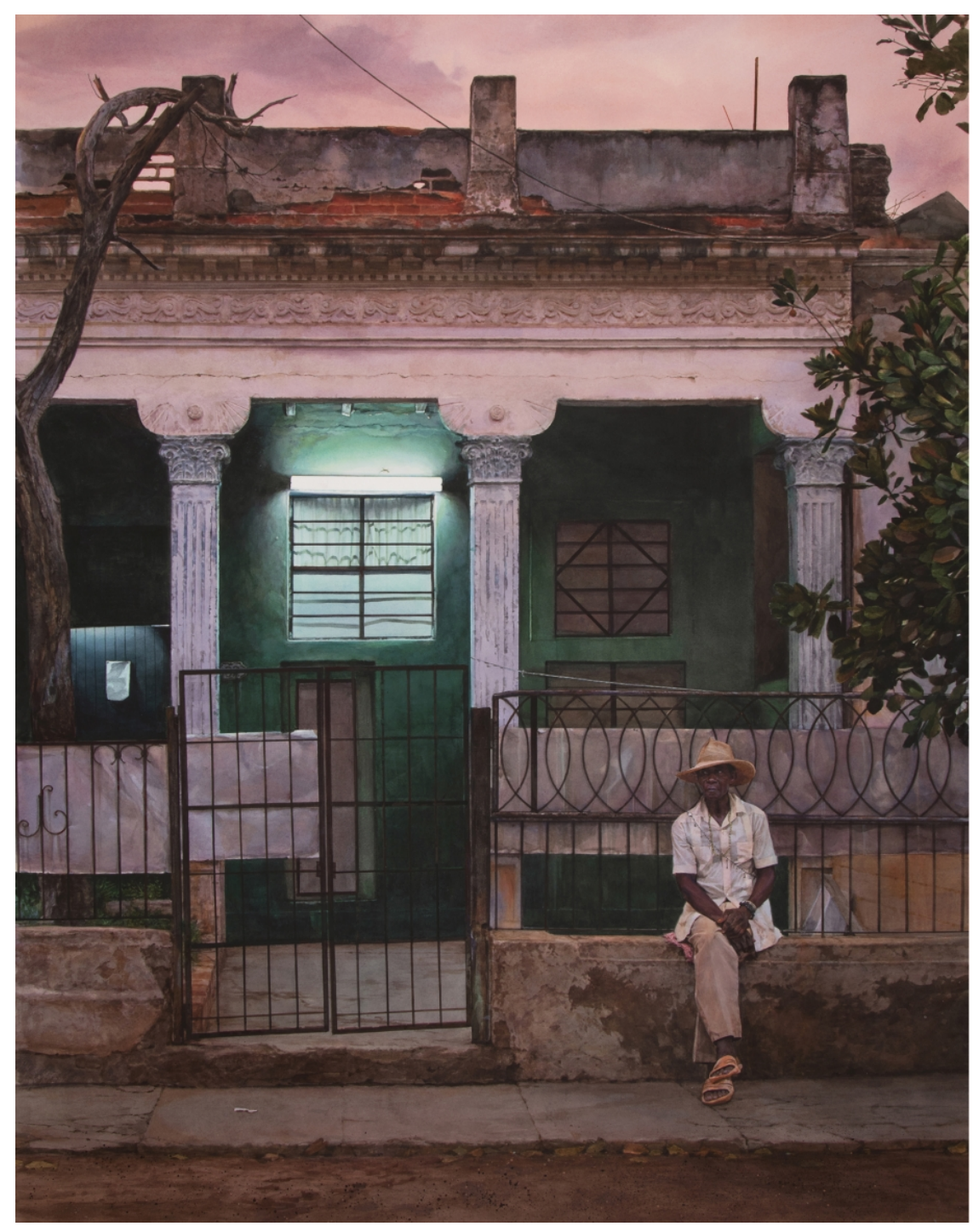
"Gecko" (2019; watercolor, 38 x 30 in.)

Twenty-six of those watercolors are included in the exhibition , A Lingering Revolution , which is on display through November 7, 2020 at Forum Gallery in New York City.