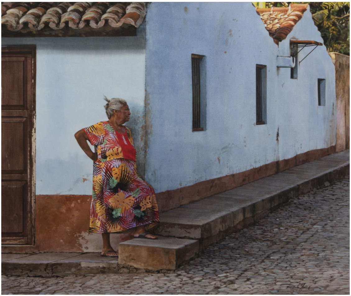
"Watchful Eye" (2018; watercolor, 21 x 25 in.)

persistent hope, ambition, and devotion that inspire the lives of the Cuban people. A child walking through the vegetable market has the bright gleam of anticipation in her eye; a laborer hauls his shouldered burden with strength and resolve; a woman reads the newspaper and is clearly absorbed.