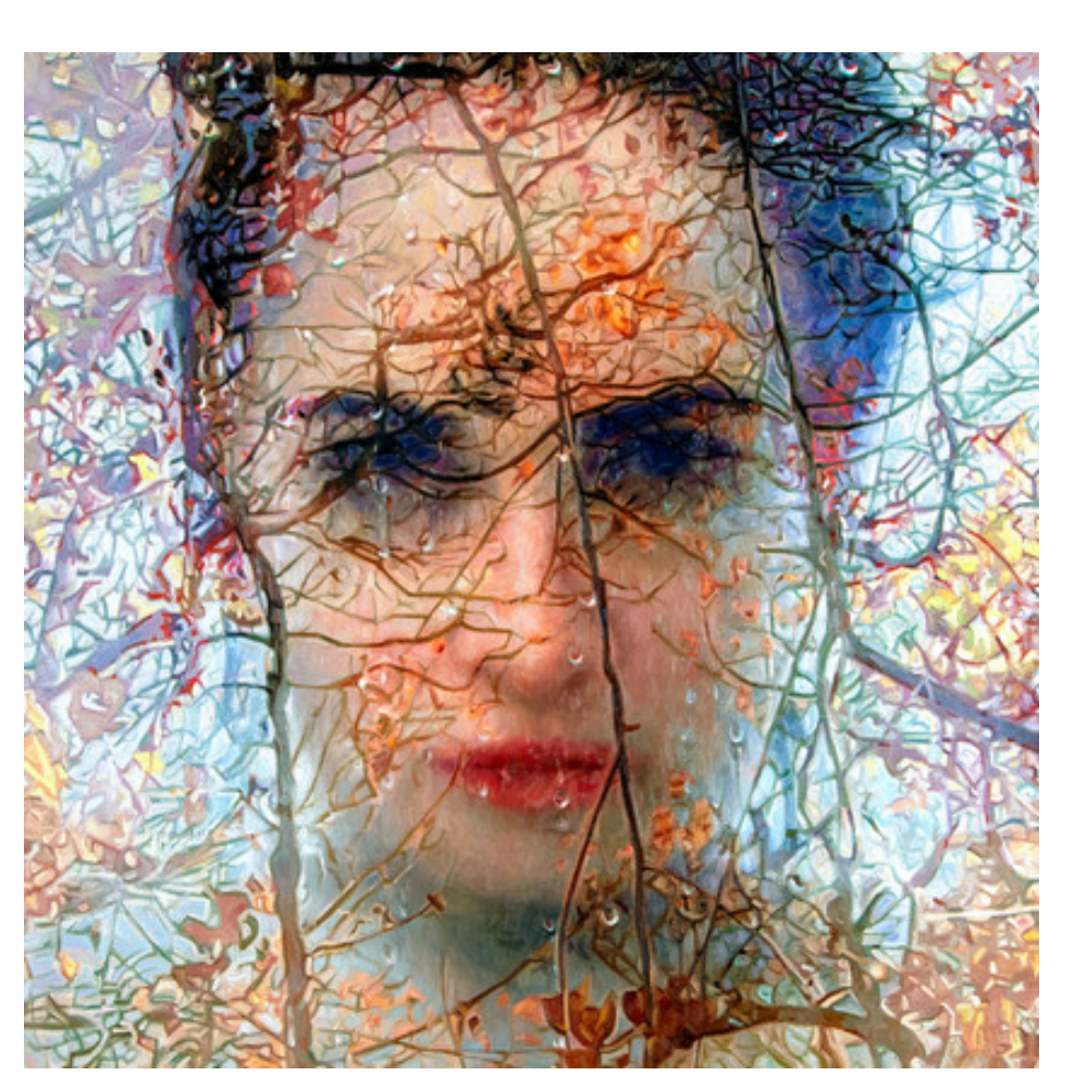
Breaking Point 4 Oct - 3 Nov 2018