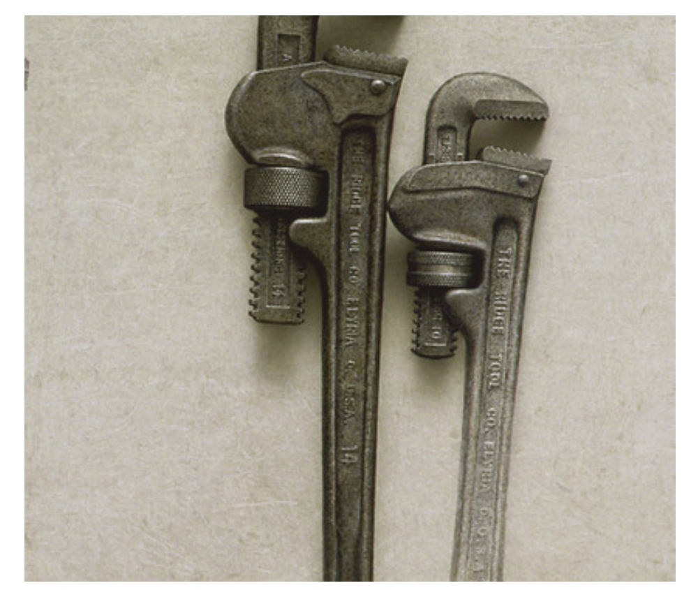
<u>Natural History</u> <u>4 Apr – 31 May 2019</u>