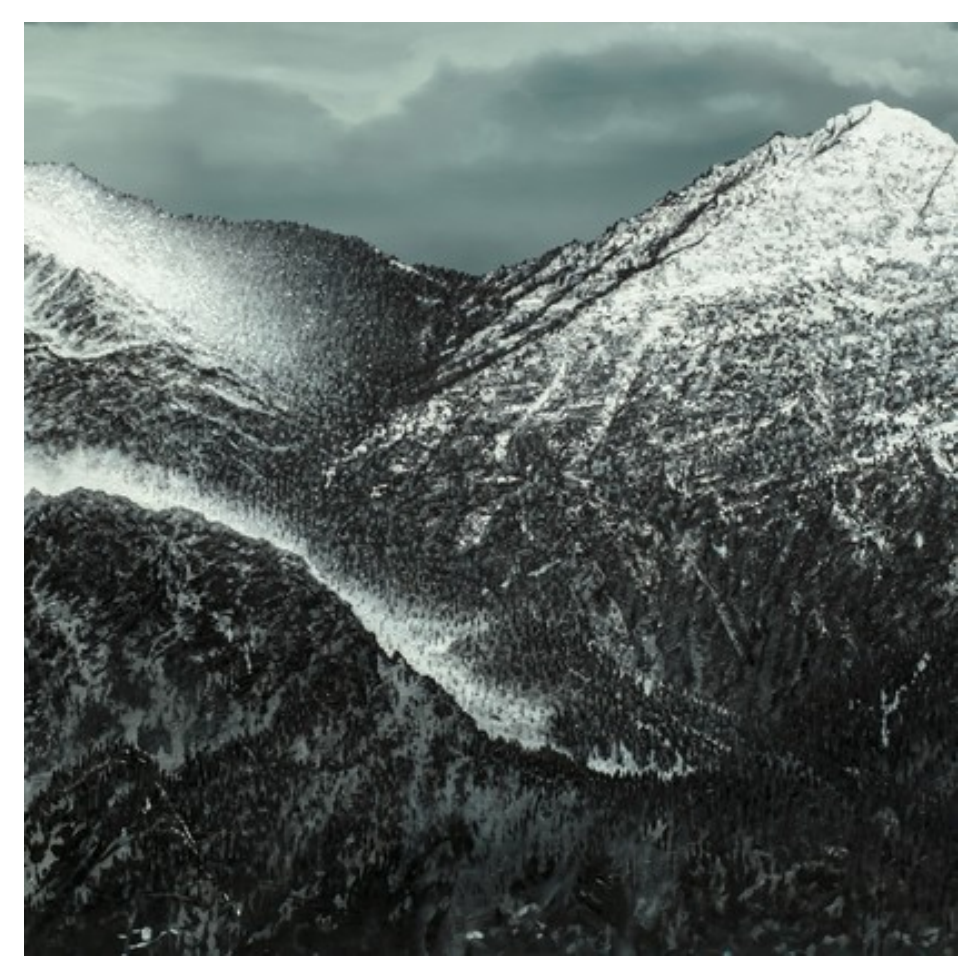
<u>Tula Telfair: Reverie</u> <u>7 Feb – 30 Mar 2019</u>