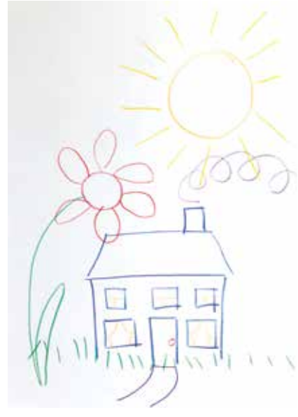
My Sunshine House

Early in the 20th century, wax-based crayons started being produced and marketed for children. In 1903, the