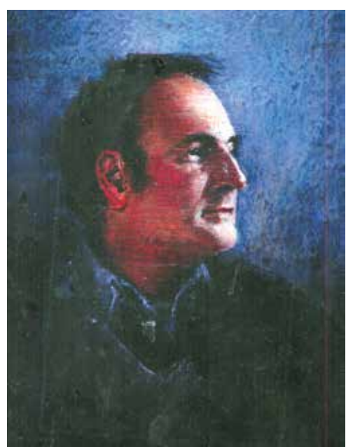
Henry by Sherry Camhy, 1990, oil pastel, 20 x 16.

with clean sticks of pigment, you may find yourself re-discovering a pleasure you first knew when you were very young.