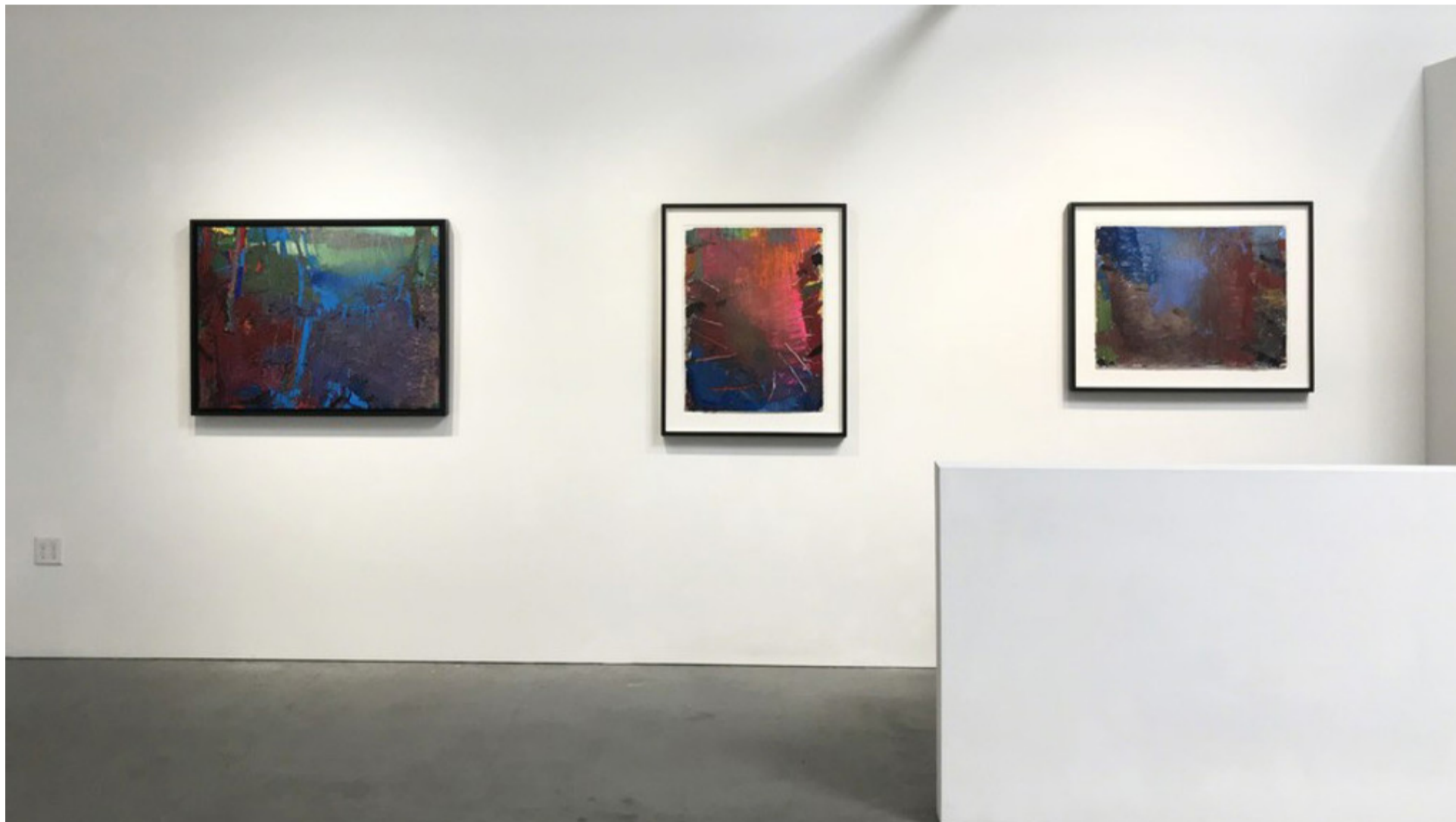
Looming Pine. Courtesy of Nancy Toomey Fine Art

Widely considered to be one of the finest American painters of his generation, Brian Rutenberg has spent forty years honing a distinctive method of compressing rich colors and forms into complex landscape paintings that imbue material reality with a deep sense of place. The allusion is often to landscape, but looking closely at his work, it is clear that his primary interest is how the painting was made. The forceful manipulation of his materials allows the viewer a visceral response to the forms within the confines of the canvas. Whether a direct representation or an oblique reference to nature, the aesthetic components of line, space and color allow for the immense possibilities of the imagination and a nod to our shared commonality of human experience.