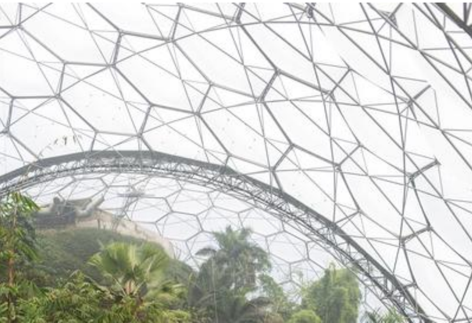
Scotiabank Contact Photography Festival Announces Public Installation Artists of 2020