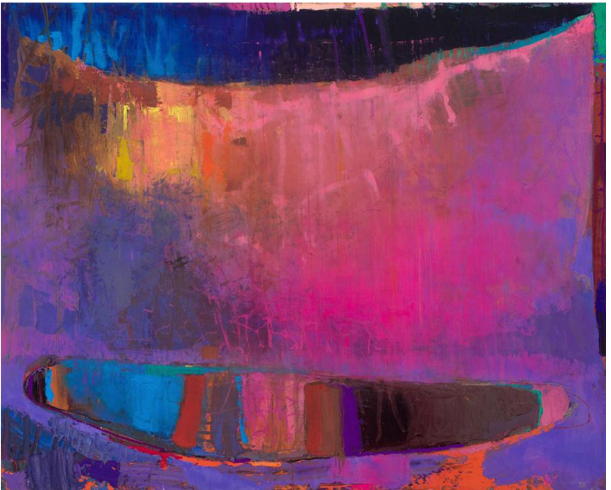
"Clamdigger", 2019, oil on linen, 55 x 68 inches

( ARTFIXdaily.com ) New York, NY – From February 27 through April 25, 2020, Forum Gallery, New York, will present The Pond , an exhibition of new abstract landscape paintings by Brian Rutenberg. For this exhibition, his seventh at Forum Gallery, Brian Rutenberg (b. 1965) has created twelve new paintings inspired by the heat, humidity and landscape of his native South Carolina lowcountry.