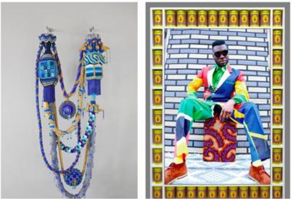
Art Paris Moves Fair Dates to May 28-31 at Grand Palais